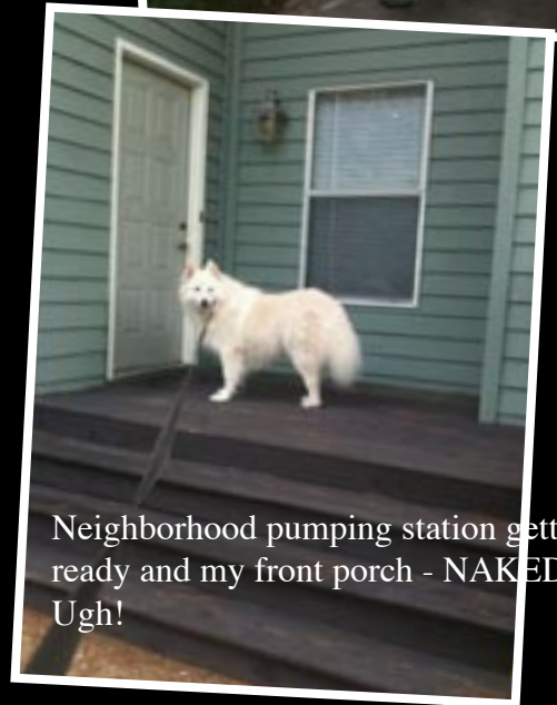
Neighborhood pumping station getting ready and my front porch - NAKED! Ugh!