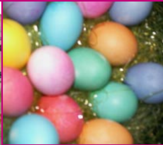
Kai's first Easter PEEP!