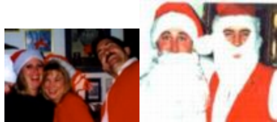
"Christmas " parties.