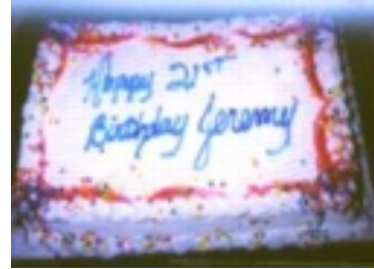
"Happy 21 st " parties,