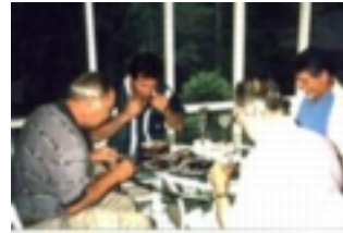
BBQ on the Veranda in Mississippi.