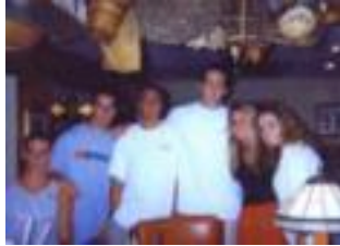
"Happy 18 th " parties,