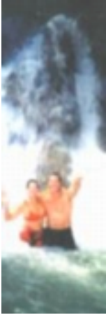
Ocho Rios, Jamaica