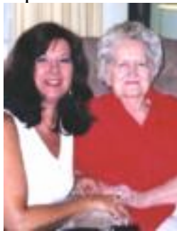
A visit with my mom.

Trips were planned home to Mississippi and to Indiana so our moms and families that could not make it to the reception could “meet and greet” the new spouse. That was extremely nice, and there are very special memories we will have forever from both of those trips.