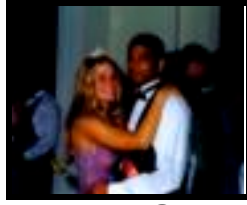
A Prom Queen