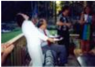
"Political" & "Client" parties, and, YUP,