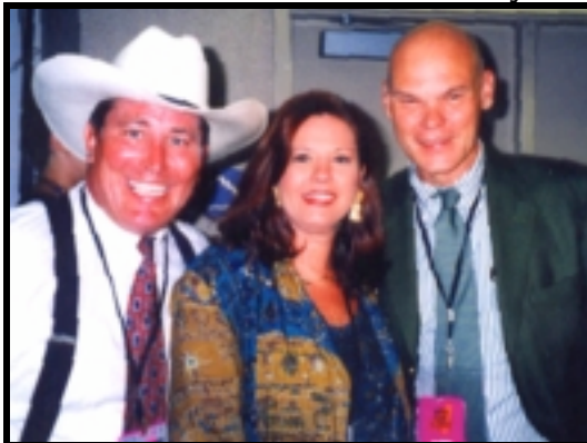
Jokin' with Wolf Blitzer and James Carvel at the Republican National Convention,