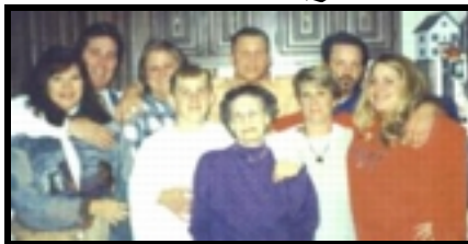
A family gathering at Thanksgiving in Indiana.