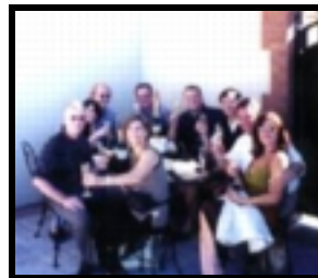
NAPA Valley Wine Country