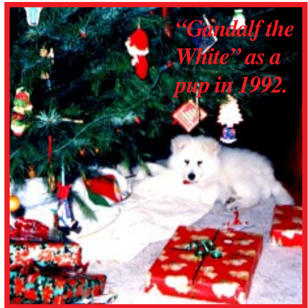
“Gandalf the White” as a pup in 1992.