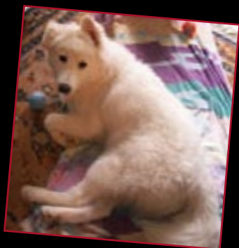
My sweet Oliver!