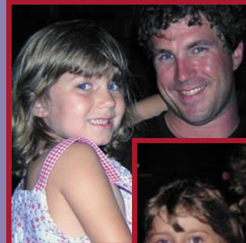
There were literally all sizes, types, and shapes.