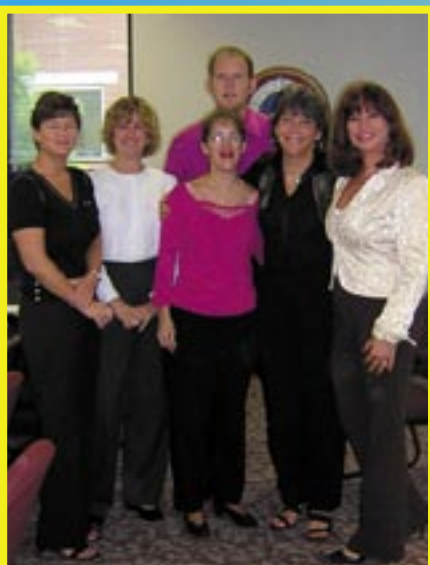
Some of my buddies at work!

rrived, we played it again as a duet. It sounded much better with her there!