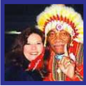
The Redskins' Mascot