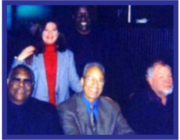
The Fearsome Foursome