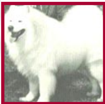
My Gandalf the White!

And did you finally see my Gandalf the White! Like I said, I have had Gandalf for eleven years now and another Gandalf before him. No one ever "got it" when I said his name was Gandalf the White...not until recently. Even last year when the first movie came out, they would say, why the White? why not the Grey.? That told me they had not read the books. . .